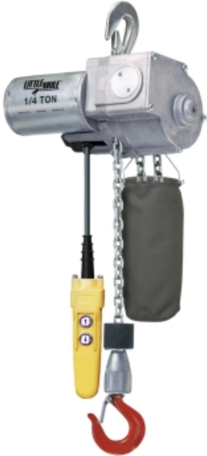
500 & 1000 Lbs. Made in USA