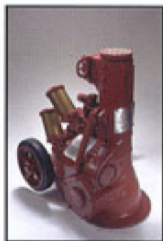
Air Motor Jack