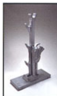
Cable Reel Jack