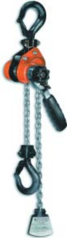
1100 LB. Capacity

Designed for close quarter, standard duty commercial applications. Short handle with low pull requirement makes these units easy to operate.