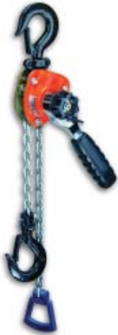
550 LB. Capacity